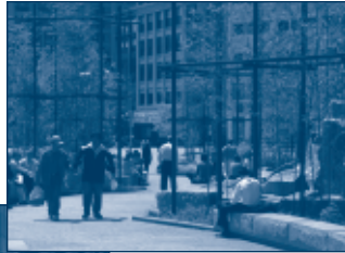
North End Parks on the Rose Kennedy Greenway Photo Credit: Rose Kennedy Greenway Conservancy 2008