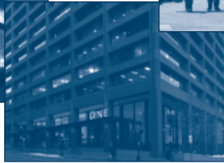
One Beacon Street, Boston's Financial District