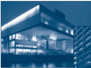
Institute of Contemporary Art, South Boston Waterfront

THREE OUT OF THE DOZENS OF GREEN-MINDED STOPS ON GREENBUILD’S PLANNED CITY TOURS