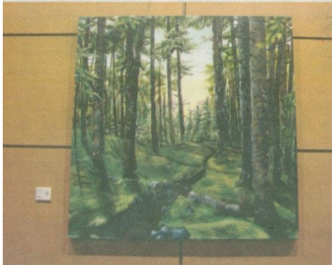
"Forest for the Trees" by Terry Bontelle, mixed media, Fort