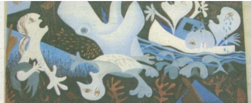
"The Gulf" by Ann Scott, oil, Fort Point Arts Community, evocative of Picasso's "Guernica".