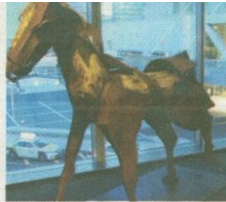
"Horse, 2010" by Jamie Burnes, sculpture in Cor-Ten steel, cedar, stone, rock.