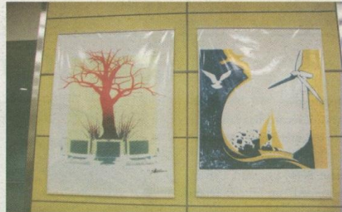
A silk screen banner diptych at the Convention Center's Winter Solstice Art Celebration.